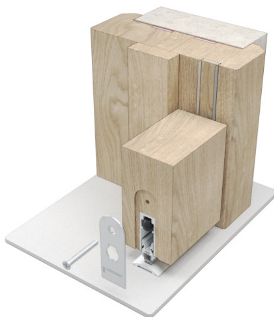
Finesse™ (Shown with LAS8001 si + LAS4001)